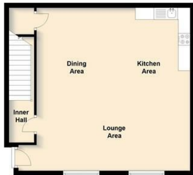
Raised Ground Floor

These plans are not to scale and are for illustration purposes only Plan produced using PlanUp.